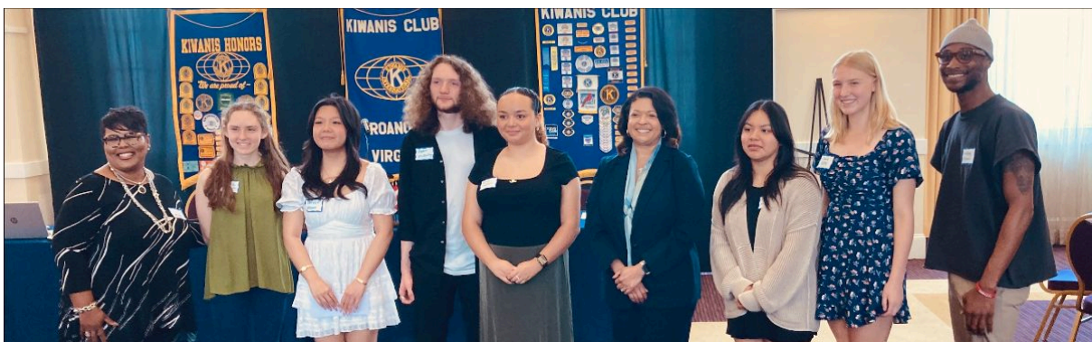
Scholarship winners group picture